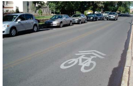
Sharrows make roads safer for bicyclists and drivers

Blendon Township is designating signed shared roadways on Paris and Buenos Aires Boulevards.