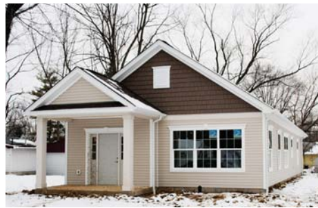
Clearing blighted properties encourages new growth in existing neighborhoods

We are helping to revitalize neighborhoods throughout Franklin County by demolishing abandoned or unsightly houses. These cleared sites can then be used for productive purposes such as community gardens or new homes.