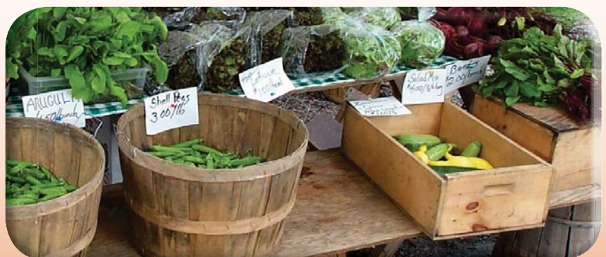
The farmers market at the Blendon Township Senior Center sells locally grown fruits and vegetables, connecting residents with area farmers

The township continues to seek new vendors for the market, which begins its second year in July.