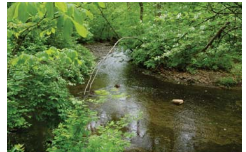
Clean Streams Northeast will protect Alum Creek from environmental damage