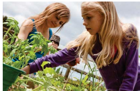
Community gardens provide fresh food, educational opportunities and gathering spaces

Residents can apply for a garden plot at the township.