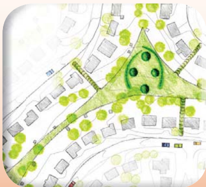
Designs for the Sunbury Woods Commons and the Park at Hempstead and Dempsey incorporate hiking trails, shelters and sledding hills

By establishing preferences for these parks, Blendon Township can realize its vision for a better, more family-friendly park system.