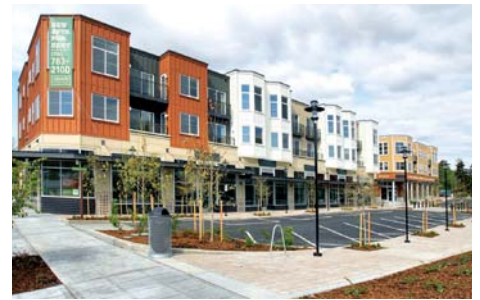
The Smart Growth Overlay will encourage vibrant, mixed-use neighborhoods

We anticipate adoption of the Smart Growth Overlay for Cleveland Avenue, Morse Road, Westerville Road, Sunbury Road, Executive Parkway, and Valley Quail Boulevard South in late Spring 2011.