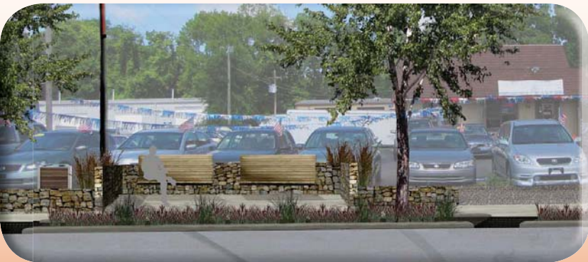
The Blendon Community Plan included visions for a pedestrian-friendly, walkable Westerville Road

Our office is working to connect the Huber Ridge neighborhood to the Alum Creek Trail. We are teaming with local officials to design and fund a new pedestrian bridge across Alum Creek.