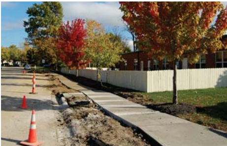
New sidewalks along Executive Parkway connect residents with shopping, transportation and jobs

New sidewalks were installed along Executive Parkway and Harbin Drive. These sidewalks will create safer routes between residential neighborhoods and the jobs, retail and parks of Blendon Township.